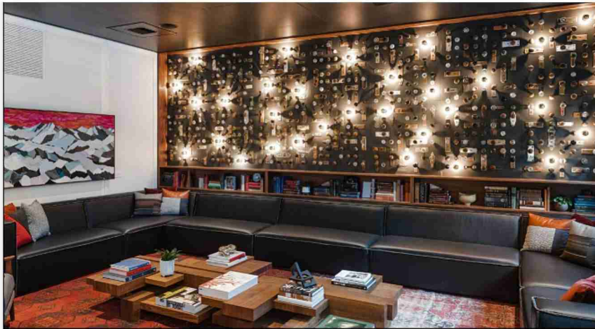
THE STATE HOTEL

The 91 rooms in Seattle's boutique State Hotel offer waterfront or city views. Hanging rods and leather catch-alls sub for typical closets.